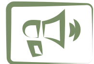
Marketing and Advertising