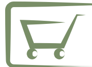
Custom Logo and Graphic Design